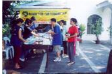
Medical & Dental Mission at Agoo